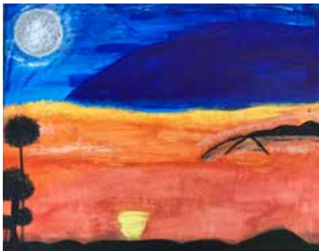
SUNSET IN THE DESERT created by T.V. 17 year-old

Through our Wellness program, Visions and Pathways youth learn about health and fitness, participate in arts and recreational