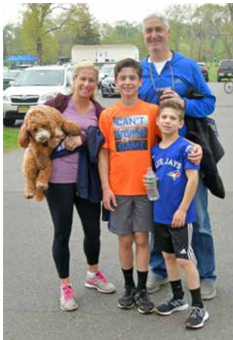
RUN AND WALK EVENT

Runners and walkers celebrated a quarter century of athleticism, fun,