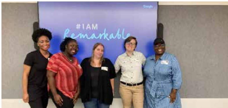
I AM REMARKABLE Workshop Hosted by J&J