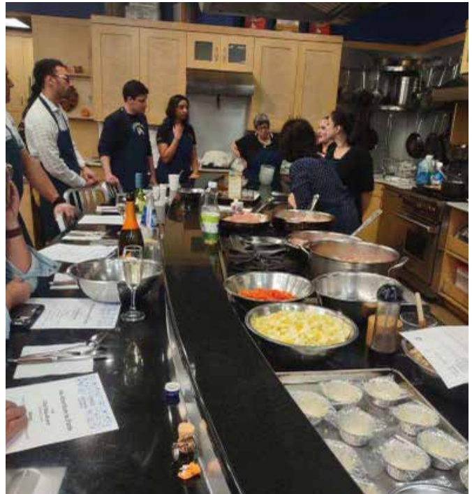
COOKING CLASS for the Skittelz! LGBTQ+ Residents Hosted by J&J's Open & Out Employee Resource Group