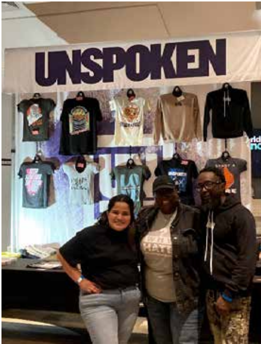
BRAHMA RESIDENTS attend the Unspoken Concert hosted by the Evangelical Chapel and Celebrate Recovery.