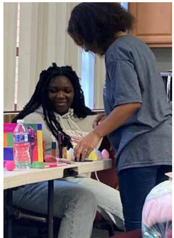
BEAUTY DAY Hosted by the Young Adult Ministry at Zarephath Church