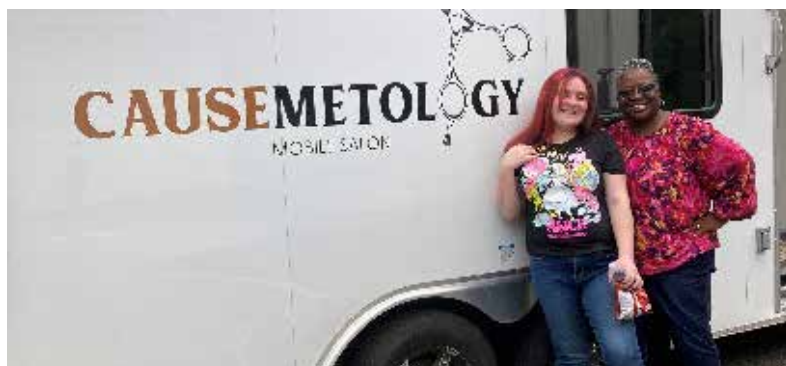
SALON DAY and Haircuts Provided by Causmetology