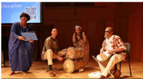
SPEKTRUMS AFRIKANS, an African dance company, Newark